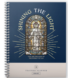
Teacher Planner (NEW!)